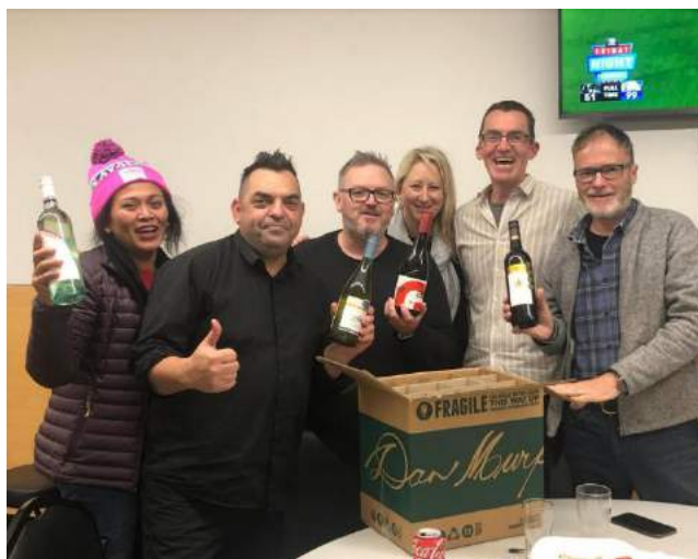
Congratulations to the winners of the night 'Sweet 16' from the U16 Girls team.